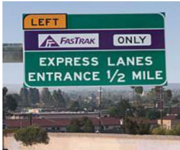
Example of a transportation system management strategy using Intelligent Transportation Systems

Examples of physical changes include turn lanes, signage, roundabouts, striping, and traffic calming measures. Changes to how the roadway is used include incident response, ramp metering, transit signal prioritization, highway access management, and managed lanes (High Occupancy Vehicle (HOV),