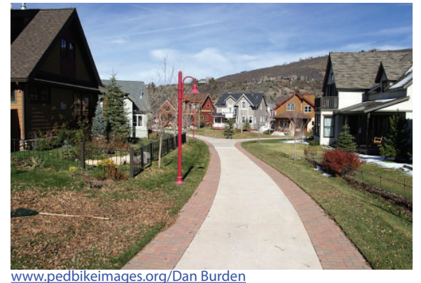
Developments could limit the use of culde-sacs in a situation

where barriers prevent a connected street network.